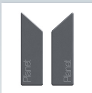
Cover plates Planet KG-A narrow