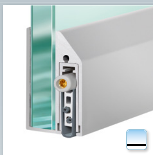
Planet KG-A8 | A10 | A12 narrow, attached and glued release side