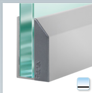
Planet KG-A8 | A10 | A12 narrow, with cover plate