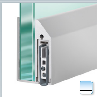
Planet KG-A8 | A10 | A12 narrow, attached and glued