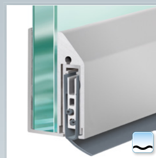
Option: Planet KG-A8 | A10 | A12 narrow, bevel lip for uneven floors