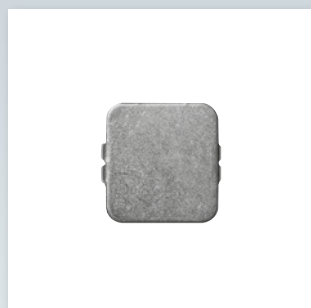
Accessories: Planet frame protector plate, type 1 (stainless), 20 x 20 mm